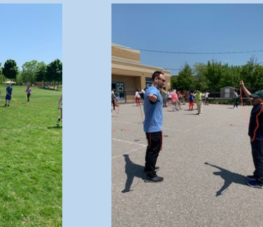
A FANTASTIC DAY!! THANK YOU FOR YOUR ONGOING SUPPORT!